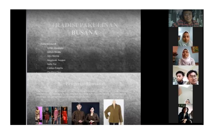
FIGURE 2. the group is presenting in the Students Webinar

The webinar is led by two speakers who provide explicit directions for the event's conduct. Then, words from the Principal, Subject Teachers, and the project manager follow. The event was then officially inaugurated by the SMKN 3 Malang principal. As stated previously, all of these responsibilities are filled by students.