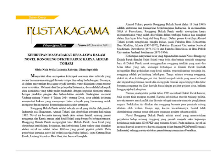
FIGURE 3. student works presented in webinars published by local bulletins

Every webinar is conducted exclusively in Java. In addition, the media team worked on the event by doing interviews and webinars with resource individuals. In addition to being questioned about their opinion of the event and the general message they wished to communicate, viewers were also asked for feedback on the program. The interviews and coverage of this event were then published in the school's bulletin, which is also where student-written articles are archived.