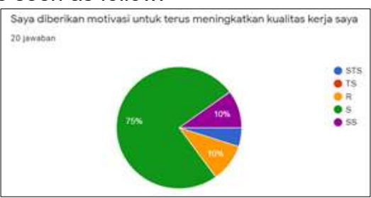
Figure 2. Teacher Motivation

to carry out their duties more professionally. Therefore, principals must create dynamic working relationships and have strategies to empower teachers. In addition to the lack of teacher empowerment in schools, another factor affecting teacher commitment in schools is the lack of motivation obtained by teachers. It can be seen as follow: