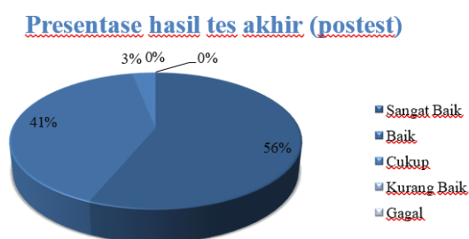
Pie Diagram 2. Details of Student Completion Percentage through posttest

After that, the learning media produced in the ancient remains of the Sriwijaya kingdom using Adobe Premiere Pro CC 2019 was presented through the Share Screen menu on the zoom meeting platform. After the learning is completed, the subject is given a posttest of 10 other questions via the Google Forms link. The posttest results obtained for 32 students were 86.87. The results of the posttest can be seen in the chart: